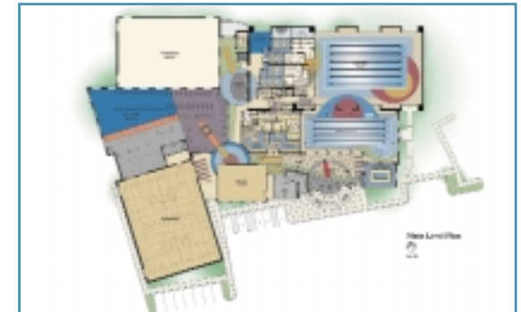
Renovation and expansion of Ellicott City Center. Phase one is scheduled to open in Winter of '08 as the Dancel Family Center. When fully complete, this center will occupy 60,000 sq. ft.